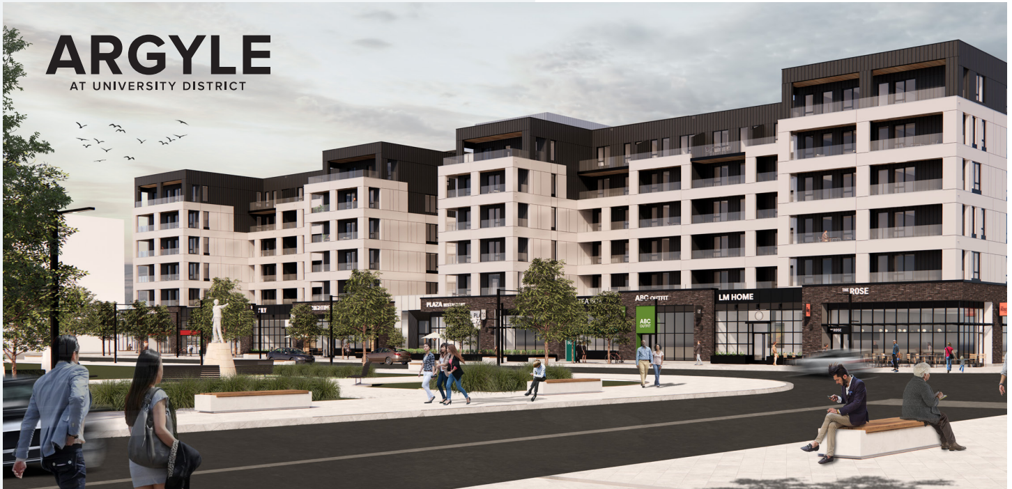
Concept renderings, subject to change.