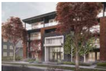
Esquire by Truman, concept rendering.

Exciting new show suites opened at the Discovery Centre this year for Esquire by Truman and Argyle by Avi Urban. Stop by and see what these new projects have to offer.