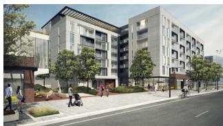
August at University District is a residential building that will be attached to the ALT Hotel by Le Germain Groupe.