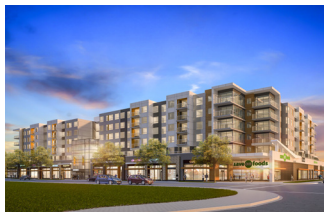
Block 22 is a mixed-use block that includes Save-on-Foods, a select number of retailers to be announced, and Gracorp's Rhapsody residential building.

Vertical Construction – design of buildings and development blocks.